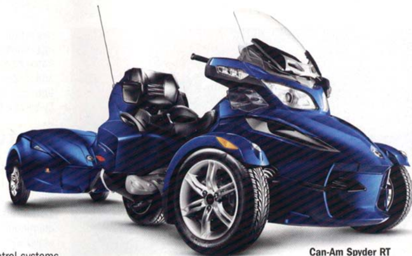
Can-Am Spyder RT

BRP is also introducing an industry first, optional matching RT622 trailer package, providing an additional 622 liters (22') of storage, designed specifically for the Spyder RT roadster and compatible with the vehicle's stability system. The Spyder RT roadster will be available for trial at authorized Can-Am dealerships this fall. Consumers currently have the option to preorder Premier Edition Spyder RT-S roadsters for delivery in the fourth quarter of 2009.